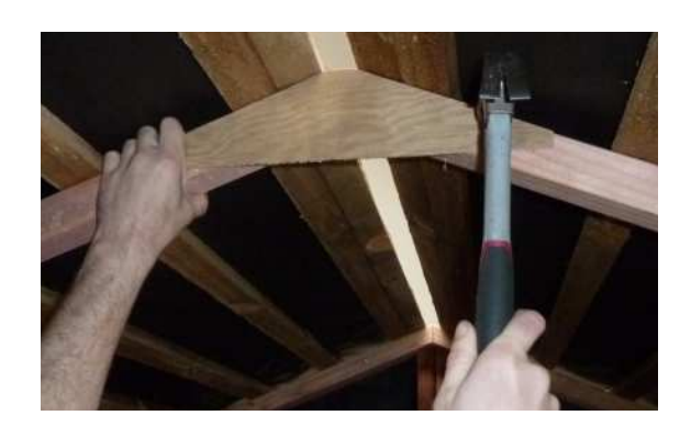
Step 17: Attach ridge flashing to shingle roof panels with 30mm clouts nailing into top purlin at approx 300mm centres.