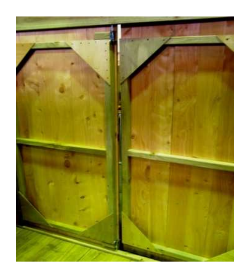
Step 26: Fit handle as shown. Attach with 2 x handle screws. Attach and tighten latch to square shaft